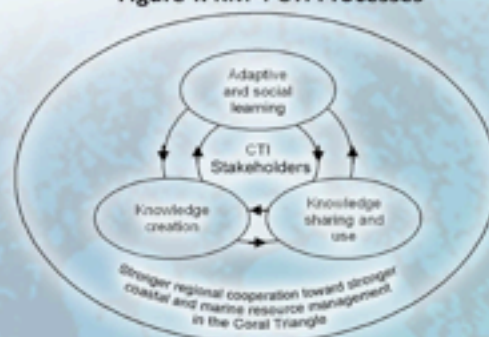
Figure 1. KM 4 CTI Processes