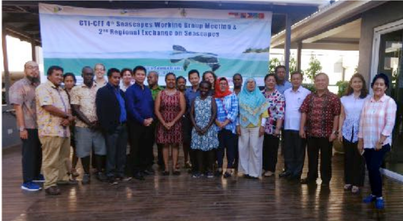
2 nd Regional Exchange on Seascapes Honiara, Solomon Islands