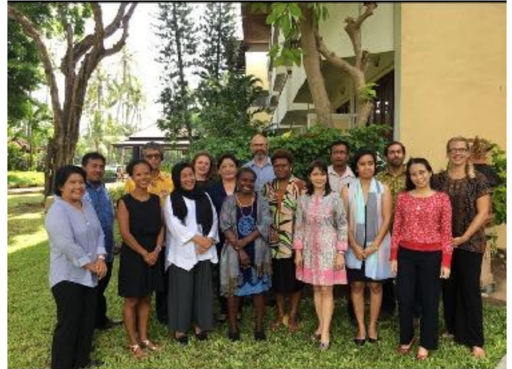
2 nd CTI Seascapes Writeshop Bali, Indonesia