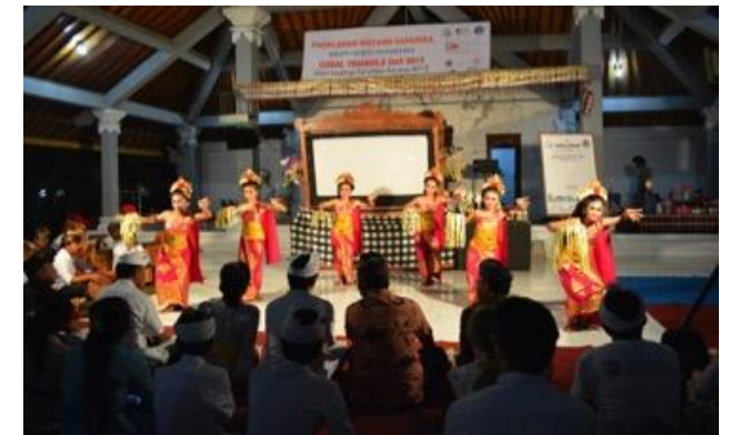
Wayang Samudra and Commitment Signing Against Marine Debris June 9, 2017