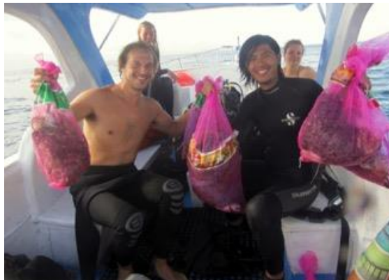
Underwater Clean Up and Coral Planting June 8, 2017