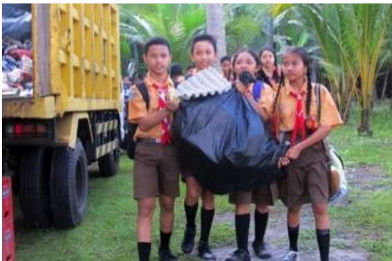
Beach Clean Up and Children's Quiz June 5, 2017