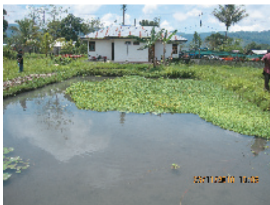
Picture 2: A weed-infested demonstration fish pond in the backyard of Ermera District Agriculture Office

A brief meeting was organized with the Ermera District Agriculture Office, which is mandated to provide agricultural extension services ranging from crops to livestock and aquaculture. However, the office lacks expertise in aquaculture extension. It generally solicits help from the hatchery at Gleno, should there be the need to provide technical advice to fish farmers. The District Agriculture Office also has a few fish ponds which are being used as demonstration ponds. Most of the ponds however seemed eutrophic in nature, reflecting poor management due to lack of technical expertise in fish pond management.