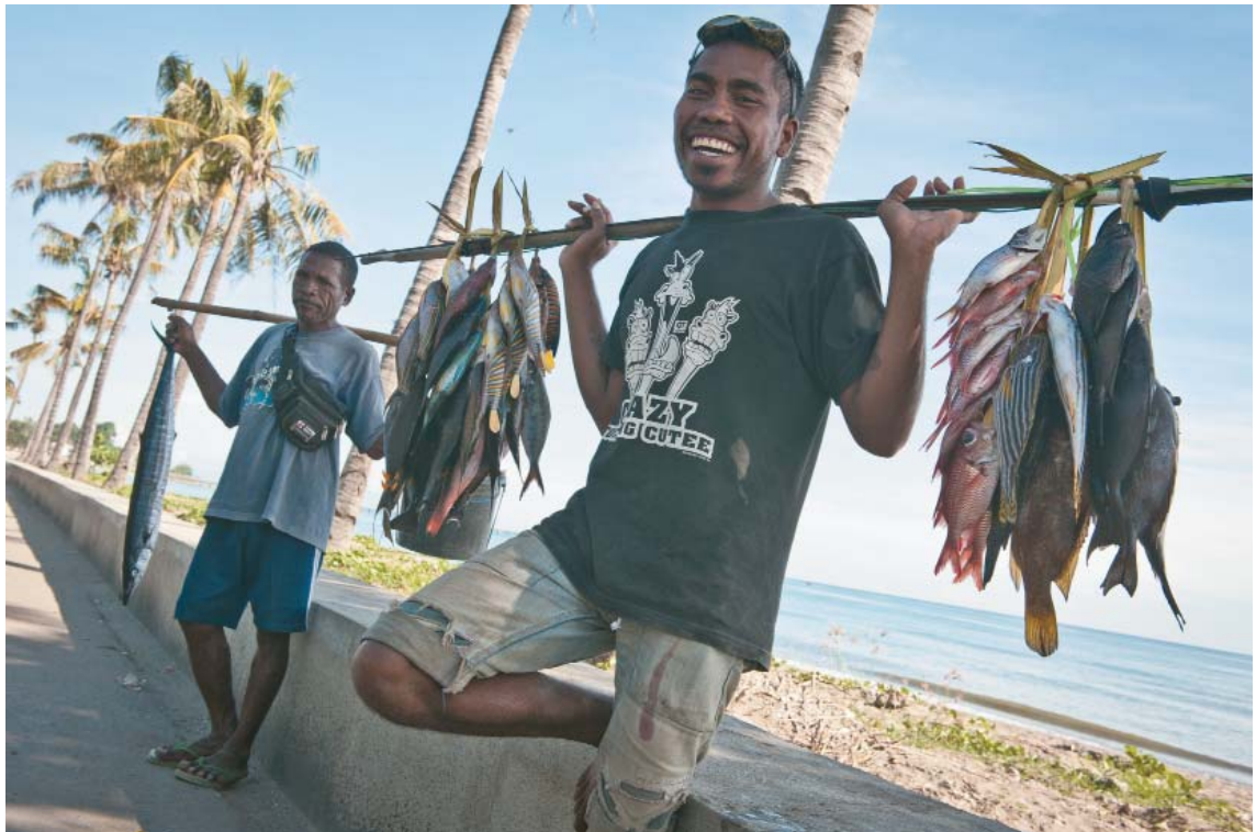
About 5,000 coastal people in Timor-Leste rely on marine resources for their subsistence livelihoods. These fishermen sell their day's catch on the streets of Dili, the young nation's capital city.

changes. Building resilience means, in part, reducing reliance upon natural resources for livelihoods, strengthening community institutions, organizations and infrastructure, and diversifying livelihoods.