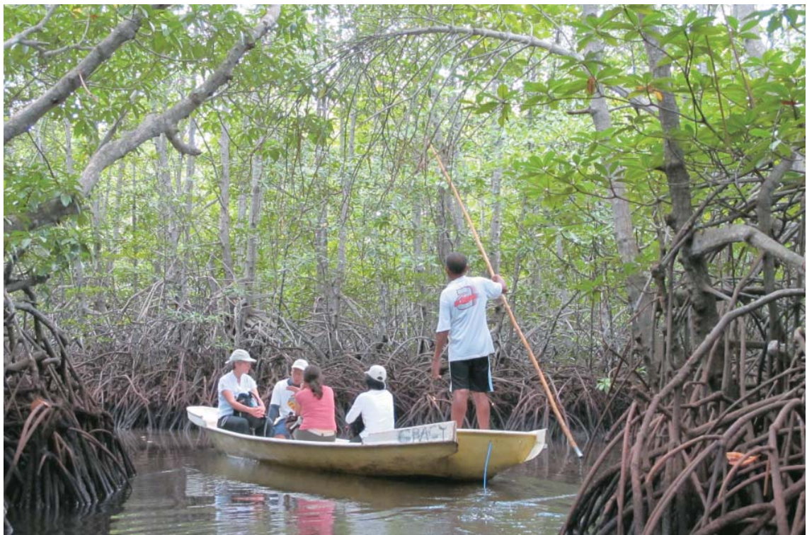
Ecotourism in Lemongan, Bali, can serve as an alternative or supplemental livelihood for fishers.

A number of different processes can be followed to develop coastal livelihoods, and it is important to stress that there is no blueprint or single correct approach. However, it is vital that the process be well planned at the operational level and be participatory, involving consultation and collaboration with the community. Recognizing that short-term, uncoordinated action can be detrimental to sustainable long-term livelihood development, it is also vital that any process be grounded in a longer-term strategic plan.