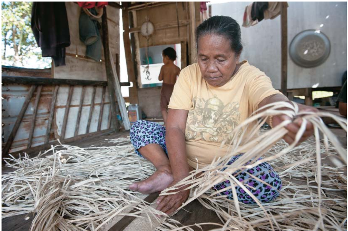
Weaving is a supplemental livelihood in Malaysia.