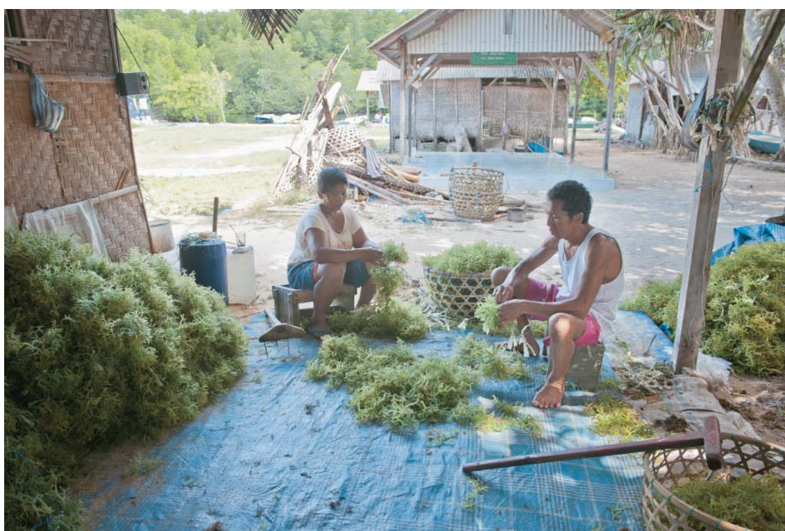
Seaweed farming in Indonesia serves as a household alternative livelihood.