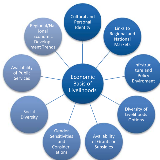
Figure 2: Sustainable Livelihoods Development should focus on the Economic Basis of Livelihoods. However, there are many additional important considerations, illustrated in this figure described in Section 4.3.

Although heavily advocated as a solution to the many problems facing coastal residents and fishers, the provision of supplemental and alternative livelihoods has had only limited success in most cases. It is assumed that people only fish as an occupation of last resort, and that people would give up fishing if a more economically viable option as available. These assumptions rarely hold true because they often fail to consider people’s strong attachment to the fishing lifestyle ( cultural and personal identity ) and the important role of economic diversification in household livelihood strategies. The reason is that most rural economies only have a limited number of employment opportunities available. In most cases, excess labor already exists in these rural economies. A resource such as land is not readily available or is too costly to purchase; credit is difficult to obtain and skills training in order to find other employment is not readily available, if at all. The rural economy may have weak links to the regional and national economy and is not growing enough to absorb the growing rural labor force. Additional reasons for the limited success with supplemental and alternative livelihoods that have been identified in the past include lack of social and technical feasibility (see below); lack of supporting infrastructure and policy environment (see below);