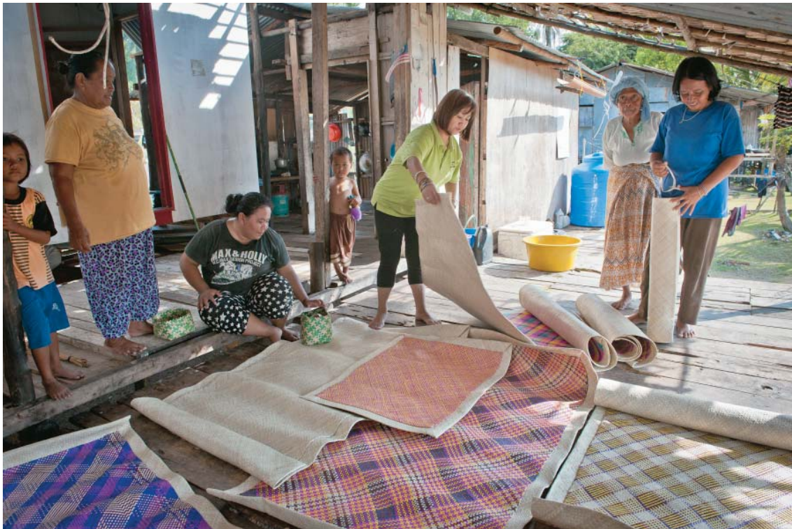
The women of Maliangin and Banggi islands, located within the Tun Mustapha Marine Park in Sabah, Malaysia, use their weaving skills, palm leaves, and recycled plastic bottles to make mats, bracelets, baskets, and other items to earn additional income for their livelihoods. The term “livelihood” can have different meanings depending on whether they are “enhanced”, “diversified or supplemental”, or “alternative” livelihoods.