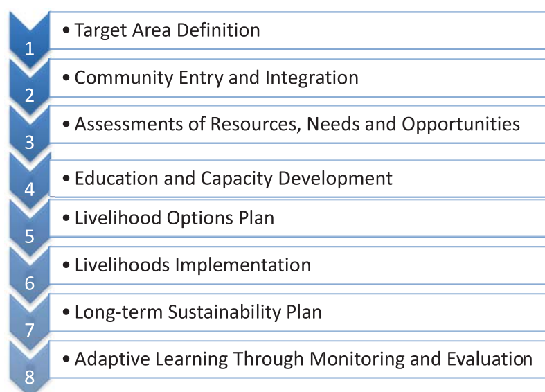
Figure 3. Suggested process for development of coastal livelihoods

A process for development of coastal livelihoods may involve the following eight steps (Figure 3):