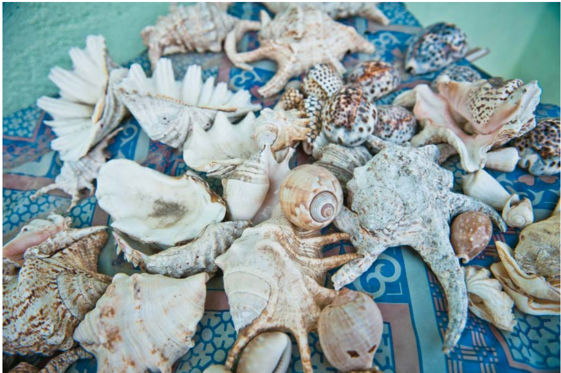
Villagers in Com, Timor-Leste, collect and sell seashells to tourists who visit their community in Nino Konis Santana National Park.