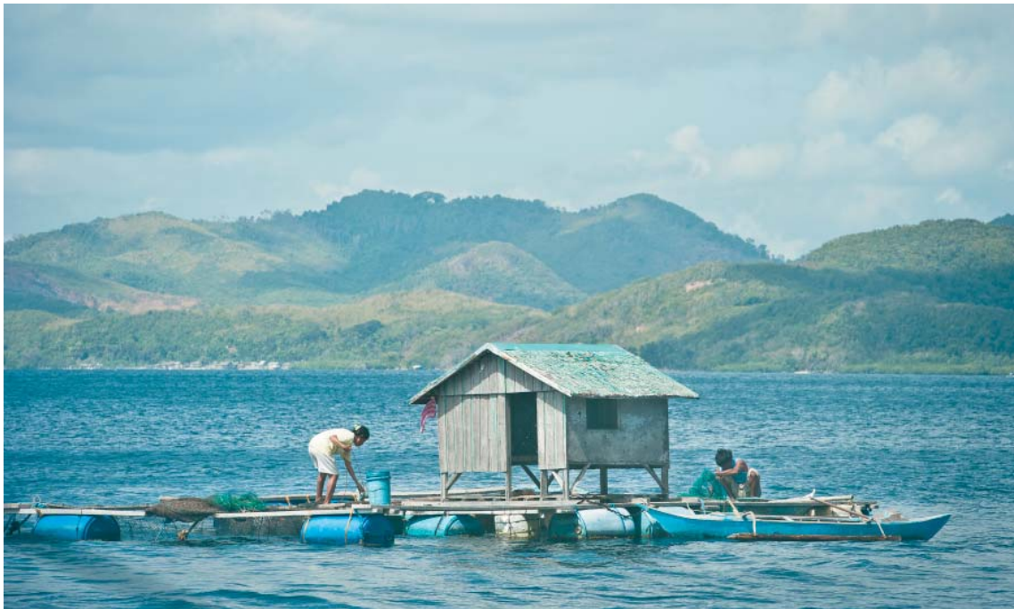
Commercial fishermen tend their live reef food fish cages in Biton village in Taytay Municipality in Palawan, Philippines. The Live Reef Food Fish Trade in the Coral Triangle is a US$1 billion per year industry.