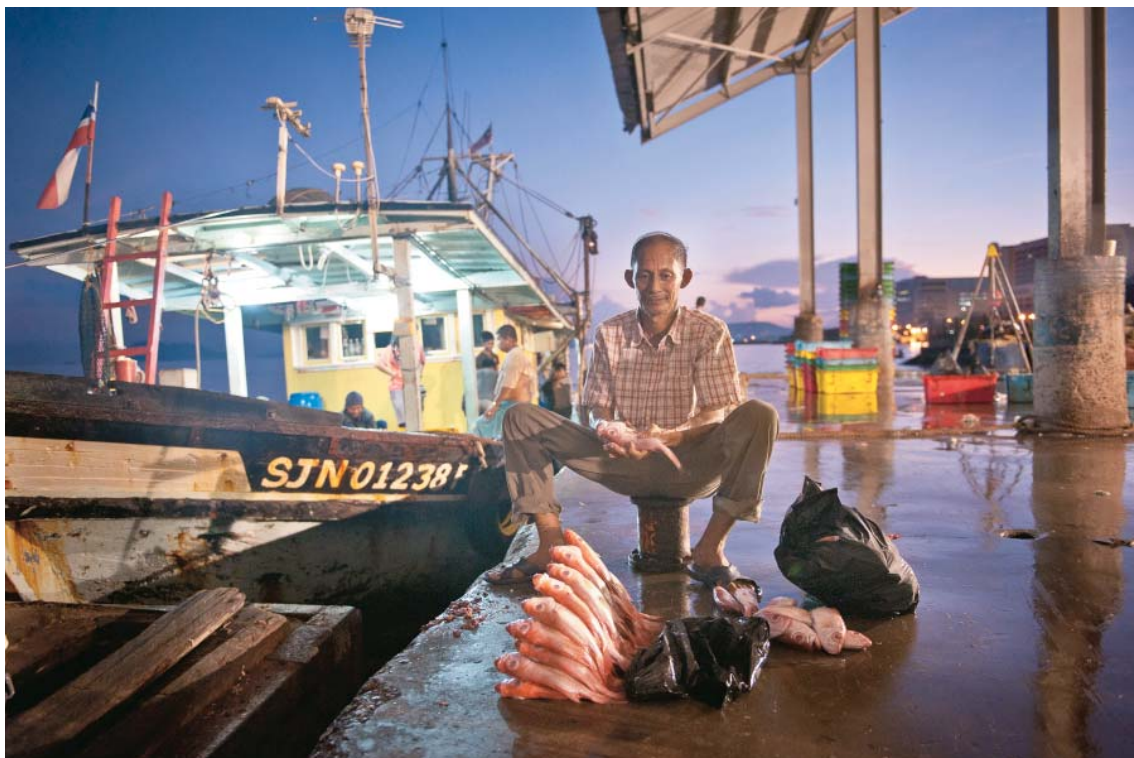
Thousands of people buy fish each day from vendors at the public market in Kota Kinabalu.

The development of coastal livelihoods should seek to address the root causes of vulnerability of coastal people and communities and to build their resilience to future threats and capacity to exploit opportunities. Development of coastal livelihoods is not merely about giving people jobs; it requires addressing fundamental social, economic and environmental reforms that affect coastal communities and livelihoods. Achieving progress in this direction means those providing assistance must engage coastal communities in a dialogue about the future they envision, the steps needed to get there, and the lessons learned along the way. At the same time it requires engaging a much broader array of actors across government, civil society and the private sector to build both understanding of the reforms needed and the commitment to undertake them.