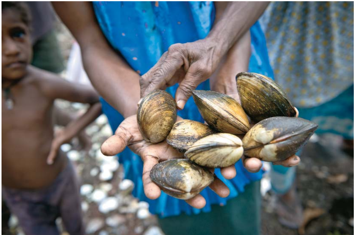
Women in Lopahan on Manus Island in Papua New Guinea collect clams they are stewarding to address food security issues arising from climate change.

In addition to livelihoods, there is a need to improve the basic public services provided to coastal households and communities. Social and community development efforts can help to ensure the expansion of opportunities in communities by integrating population, health, education, welfare and infrastructure (roads, communication, water) programs into the approach. Education, extension and skills training can support supplemental and alternative livelihood programs. A formal social security mechanism can help to make fishers and their families feel more secure about change and more willing to transition to a new fishing management strategy or livelihood.