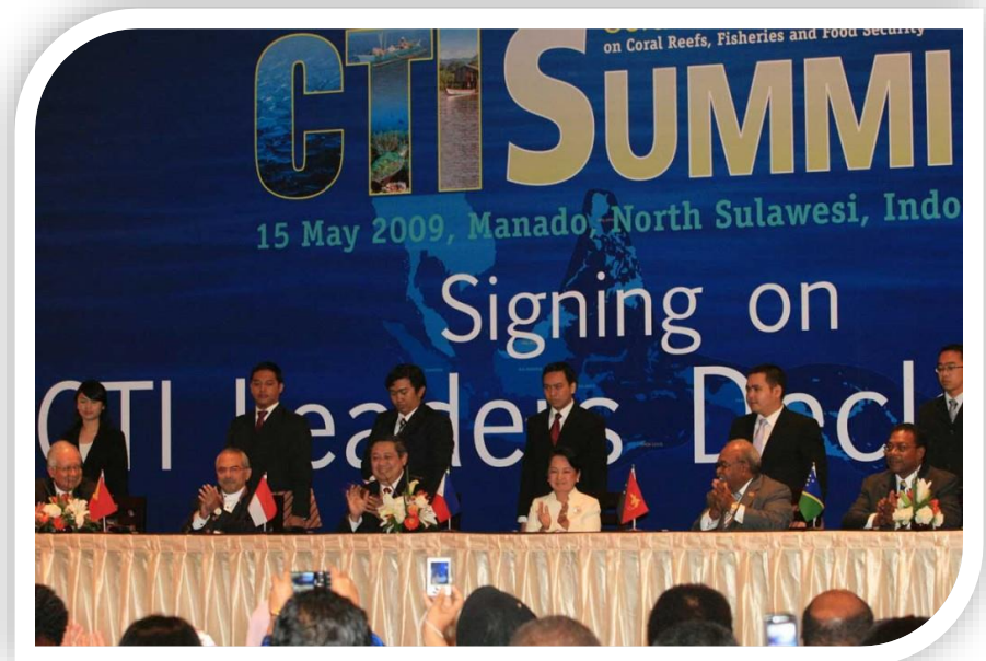
The heads of state and government from six countries, namely Indonesia, Malaysia, The Philippines, Papua New Guinea (PNG), Solomon Island, and Timor Leste, officially signed a Coral Triangle Initiative (CTI) Leaders' Declaration on Friday, May 15, 2009, in Manado during the CTI Summit.

This would be beneficial also to the general public as part of awareness building initiative.